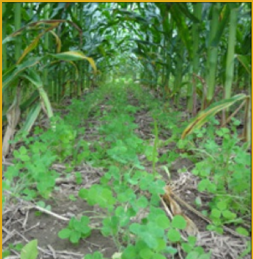
SOILS & LAND USE